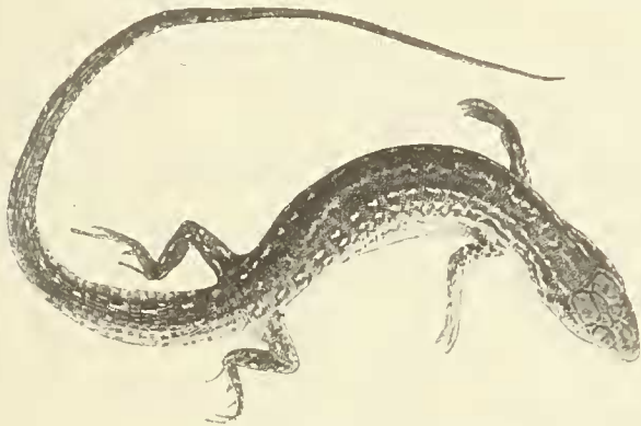
Fig. 1. Nucras ukerewensis n. sp. (Nat. size.)

Nucras ukerewensis nov. sp. (fig. 1.) Body rather short; head not depressed, its length (to ear-opening) contained 4·2 times in the length from end of snout to vent. Head shields slightly rugose; two superposed postnasals; no granules between the